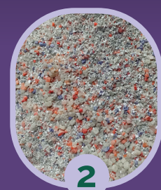
2 Fertilizer mixtures