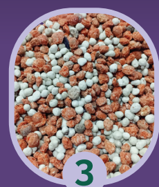
3 Fertilizer blends