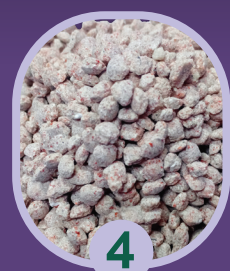
4 Granulated compound fertilizers