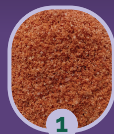
1 Straight fertilizers